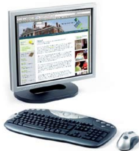
PlaceMakers' iCharrette website helped expand the reach of Early County 2055 and court investor interest throughout the Southeast.

Services provided included Economic Visioning, Image Preference Survey, Regional Transportation Study, Charrette Planning and Orchestration, Urban Design, Architectural Design, SmartCode Customization, and iCharrette communications and outreach.